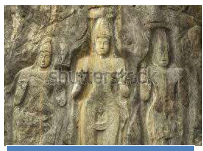
Mahayana period-Buddhist statues